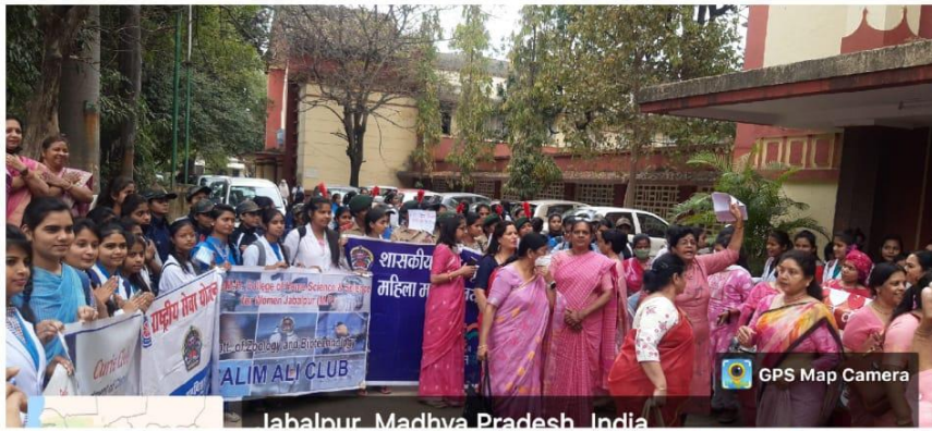
Jabalpur, Madhya Pradesh, India