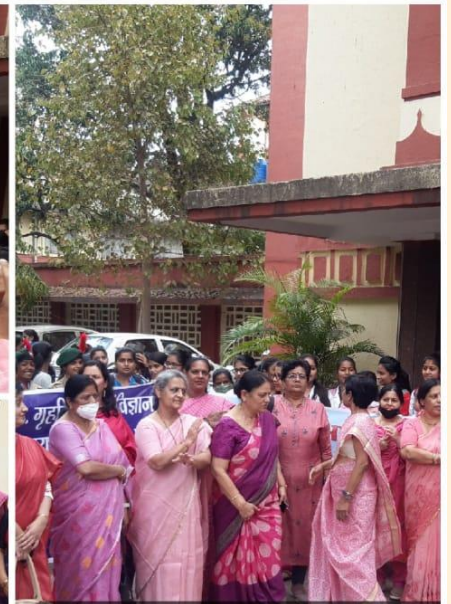
Jabalpur, Madhya Pradesh 5W6G+GR6 Home Science College, G Madhya Pradesh 482002, India Lat 23.161527° Long 79.926122° 08/03/22 01:59 PM