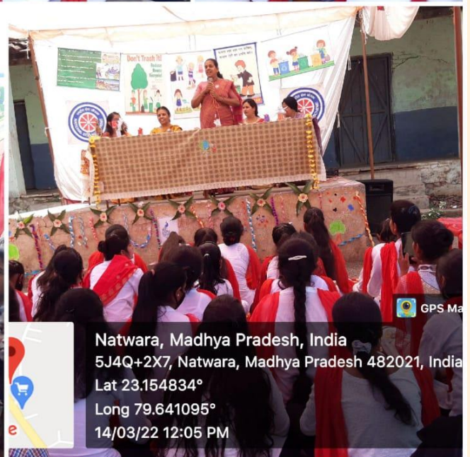
Natwara, Madhya Pradesh, India 5J4Q+2X7, Natwara, Madhya Pradesh 482021, India Lat 23.154834° Long 79.641095° 14/03/22 12:05 PM