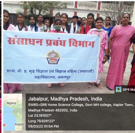
Jabalpur, Madhya Pradesh, India 5W6G+GR6 Home Science College, Govt MH college, Napier Town, J Madhya Pradesh 482002, India Lat 23.161527° Long 79.926122° 08/03/22 01:54 PM