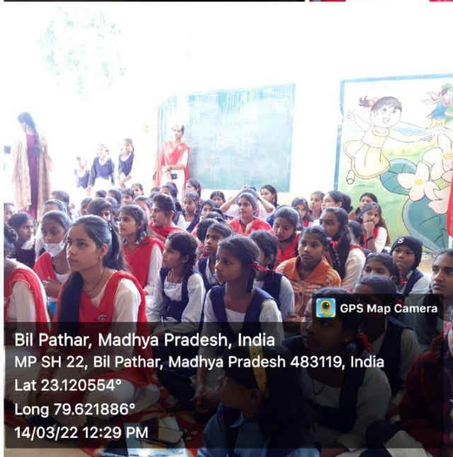
Bil Pathar, Madhya Pradesh, India MP SH 22, Bil Pathar, Madhya Pradesh 483119, India Lat 23.120554° Long 79.621886° 14/03/22 12:29 PM