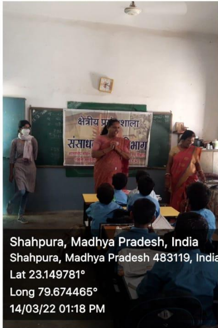
Shahpura, Madhya Pradesh, India Shahpura, Madhya Pradesh 483119, India Lat 23.149781° Long 79.674465° 14/03/22 01:18 PM