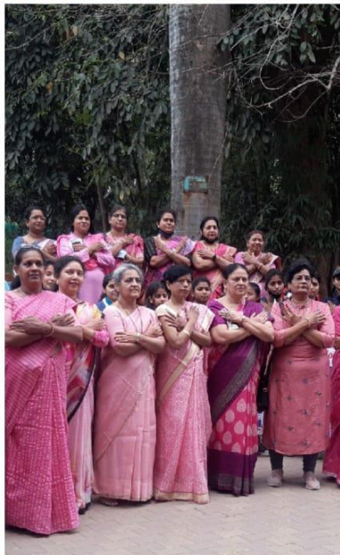
Jabalpur, Madhya Pradesh, I G+GR6 Home Science College, Govt ya Pradesh 482002, India 3.161527° 79.926122° 8/22 01:58 PM