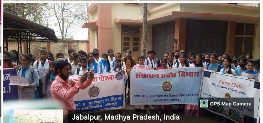
Jabalpur, Madhya Pradesh, India