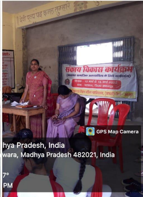
Madhya Pradesh, India Natwara, Madhya Pradesh 482021, India 7° PM