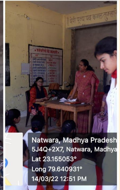
Natwara, Madhya Pradesh 5J4Q+2X7, Natwara, Madhya Lat 23.155053° Long 79.640931° 14/03/22 12:51 PM