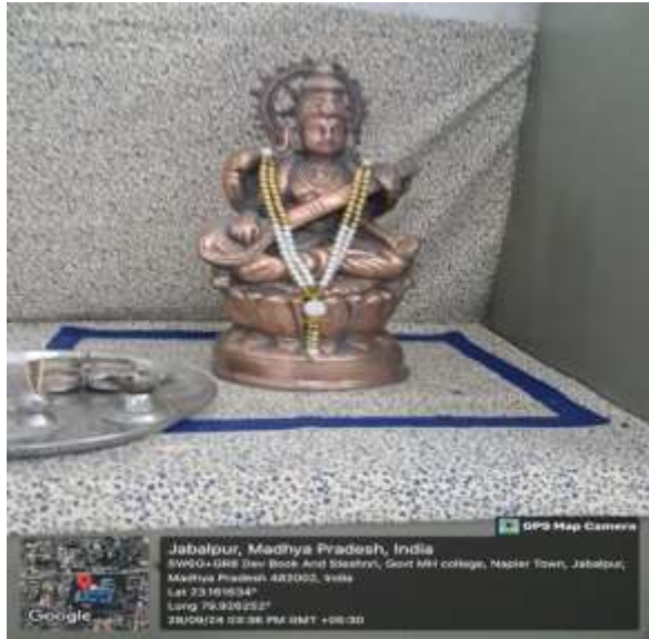
Donated by Alumni Rs 70,000/-