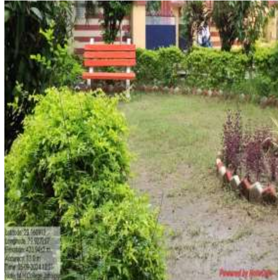
Donated by Alumni (1974 batch) Rs 45,000/- (Rate of 4 bench)