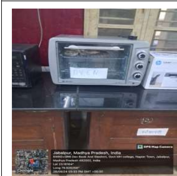
Jabalpur, Madhya Pradesh, India 5W60-GR6 Dev Book And Stashni, Govt MH college, Napier Town, Jabalpur, Madhya Pradesh 482002, India Lat 23.181834° Long 79.928282° 28/09/24 03:33 PM GMT +05:30