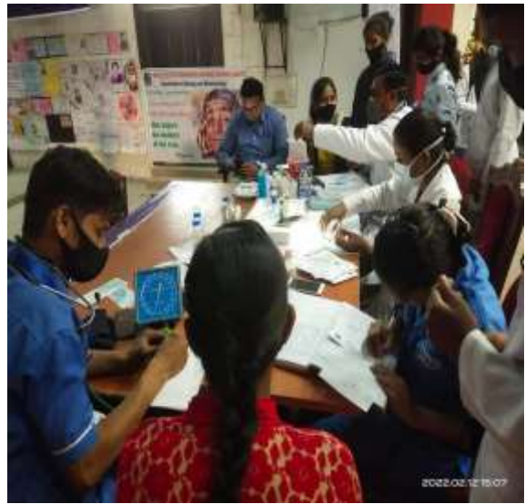
Health Camp Organized by Alumni