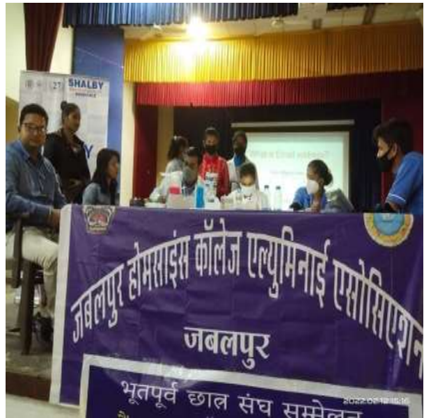
Total Expenditure - Rs 75,000/-