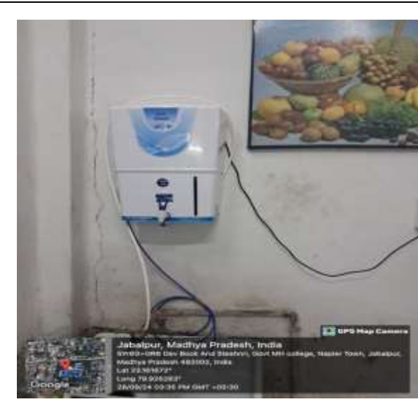
Jabalpur, Madhya Pradesh, India 5W60-GR6 Dev Book And Stashni, Govt MH college, Napier Town, Jabalpur, Madhya Pradesh 482002, India Lat 23.181834° Long 79.928282° 28/09/24 03:35 PM GMT +05:30