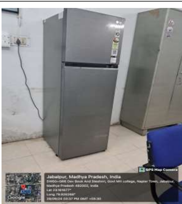
Jabalpur, Madhya Pradesh, India 5W60-GR6 Dev Book And Stashni, Govt MH college, Napier Town, Jabalpur, Madhya Pradesh 482002, India Lat 23.181834° Long 79.928282° 28/09/24 03:37 PM GMT +05:30