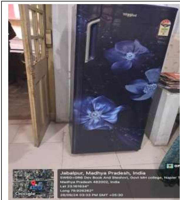
Jabalpur, Madhya Pradesh, India 5W60-GR6 Dev Book And Stashni, Govt MH college, Napier T Madhya Pradesh 482002, India Lat 23.181834° Long 79.928282° 28/09/24 03:33 PM GMT +05:30