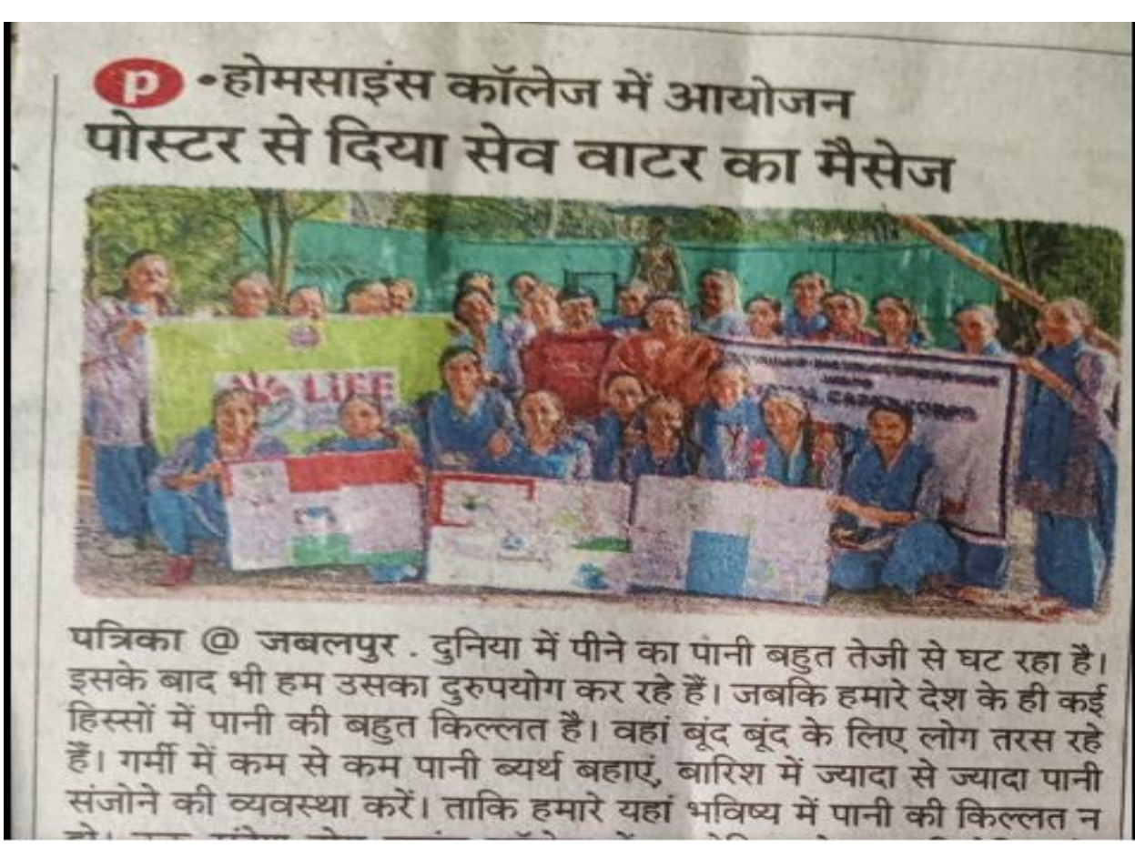
Water Conservation Awareness 30/05/2023